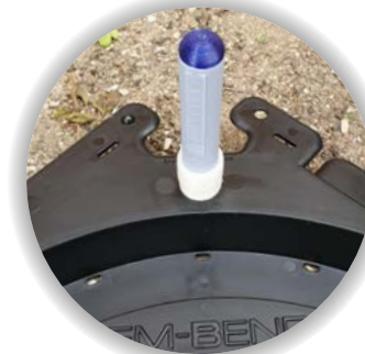
Combined with EM-Bend