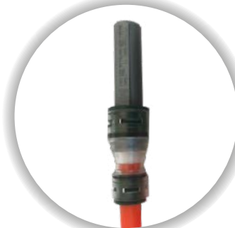
15 bar pressure tight with reducer (optional)