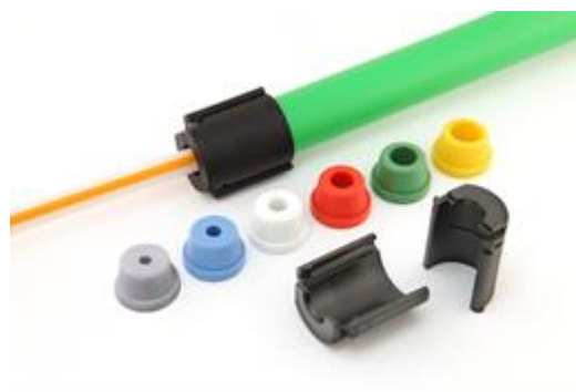
Example of product, size 25mm