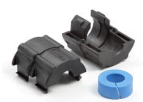
Example of product, sizes 10-20mm

Supplied 2 half shells and a split rubber seal