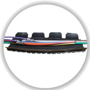
Stage 1 Wrap around the tube bundle

Further instructions are available on request.