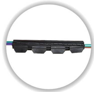
Stage 2 Pull the tabs through the loops