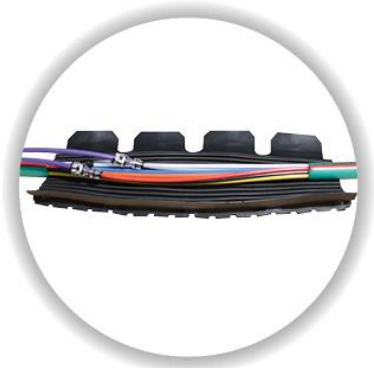
Stage 1 Wrap around the tube bundle

Further instructions are available on request.