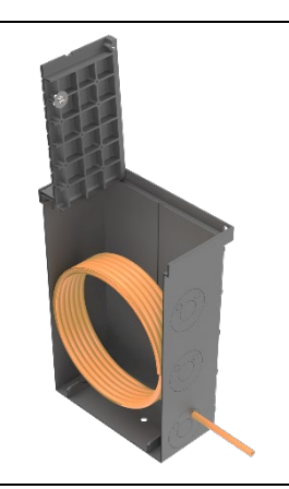
Microduct Coil Storage Capacity to hold up to 15m+ of 7mm microduct