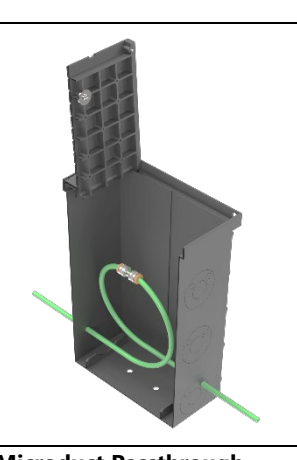
Microduct Passthrough Front to back microduct connection via connector. Ideal for underground entires.