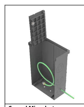
Capped Microduct Homes passed, ready for future customer connection