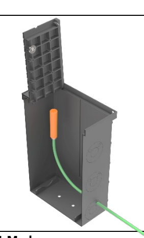
EM-Marker Precisely locate buried services up to 1.2m depth.